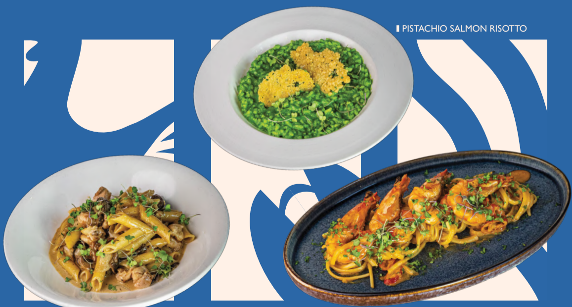
DRUNK CHICKEN PENNE