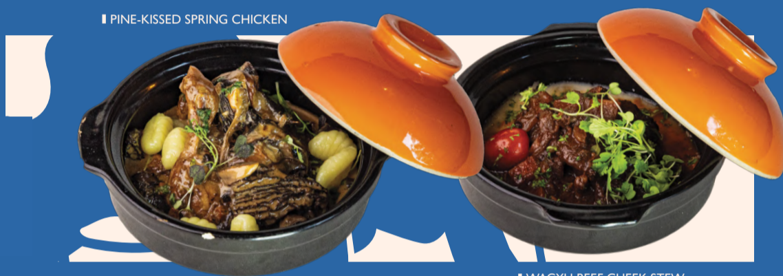
PINE-KISSED SPRING CHICKEN