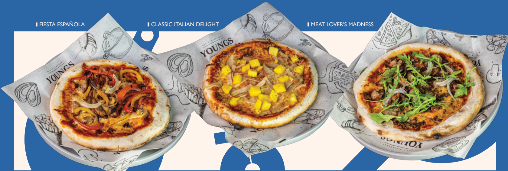
MEAT LOVER'S MADNESS