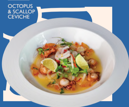
OCTOPUS & SCALLOP CEVICHE