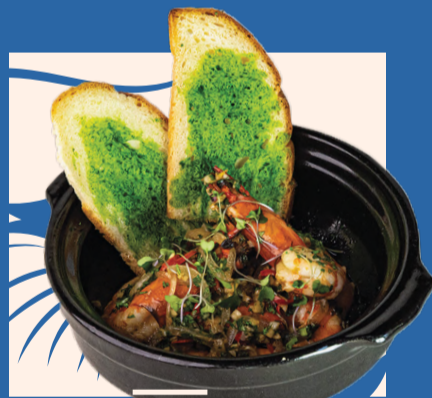
GARLIC CHILI SHRIMPS